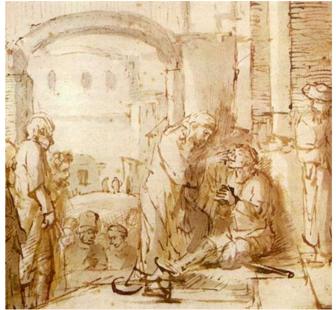
Jesus heals the blind man (Rembrandt)

The greatest part of Jesus' life is a hidden life. It is a life lived under the authority of his parents during which he grew to maturity and increased in wisdom, in stature, and in favour with God and people. Although the gospels remain silent about this period of Jesus' life, this silence is very revealing. It reveals that the good news is first of all that God came to live among us, to be Emmanuel, God with us, and to share the ordinariness of our daily existence. Jesus wanted to be known as we are known.